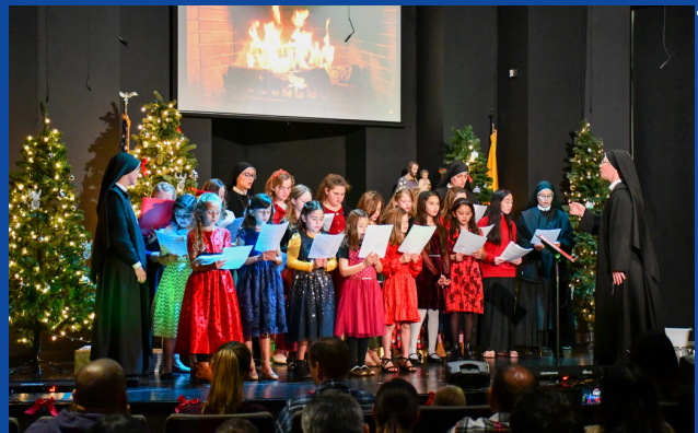
The Girls' Choir performed "Mary's Lullaby" and "Tu Shendi Dalle Stelle."