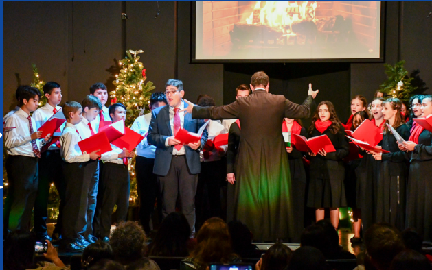
Upper Academy Boys and HS Girls performed "The 12 Gifts of Christmas."

20 years of Christmas program traditions!