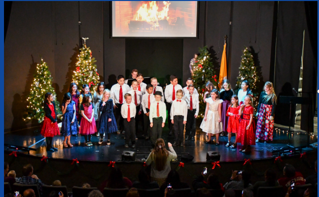
3rd Grade and 4th Grade performed "Dominic the Donkey."