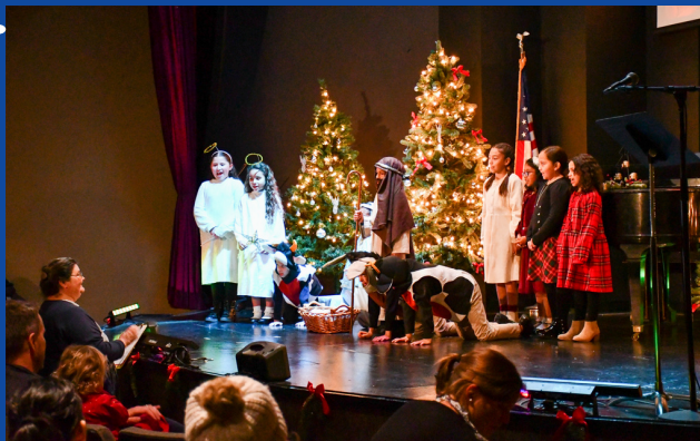
2nd Grade performed "Oh Come Little Children" accompanied by violin.